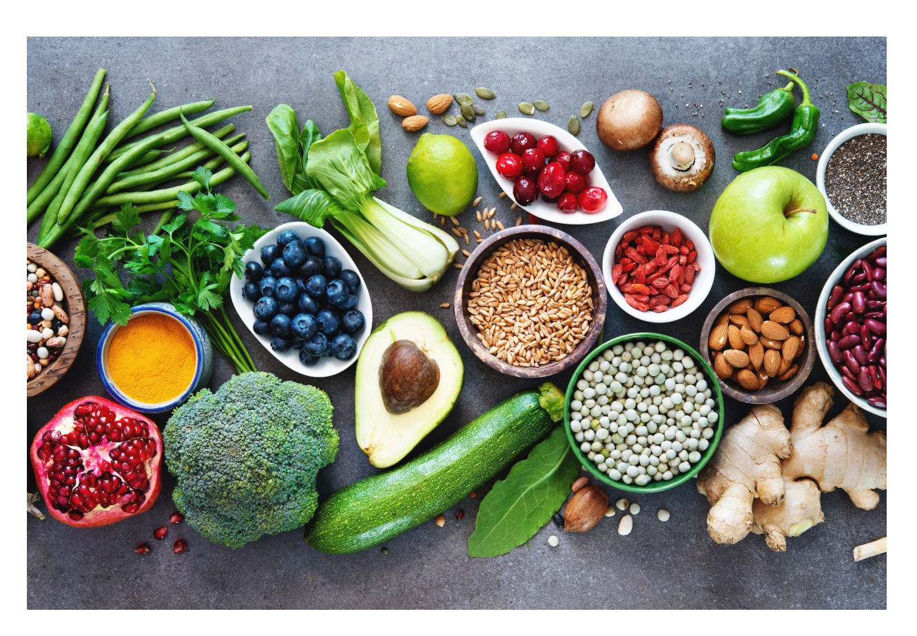
The Villages WFPB Support Group Monthly Digest