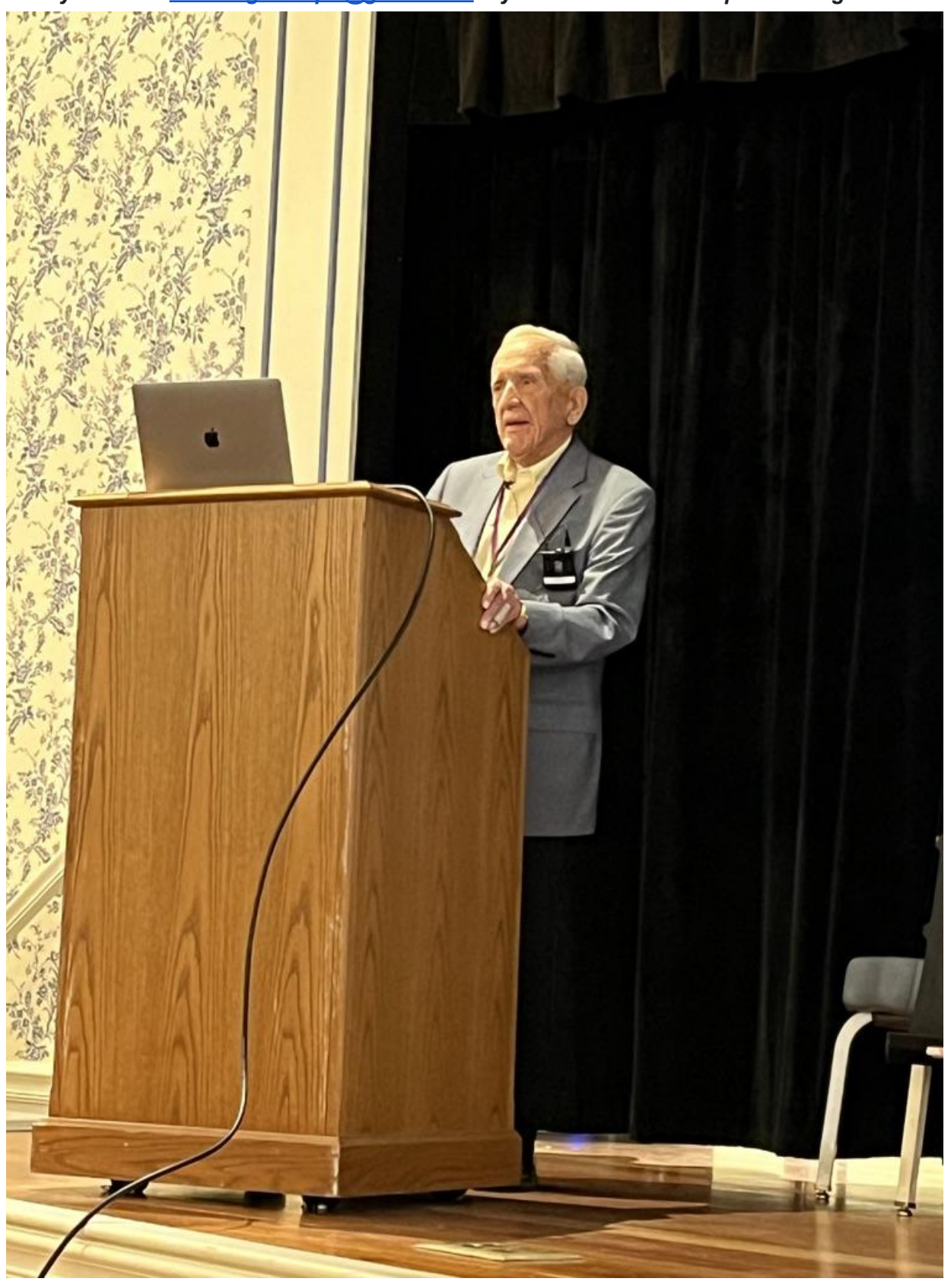
The Future of Nutrition $28